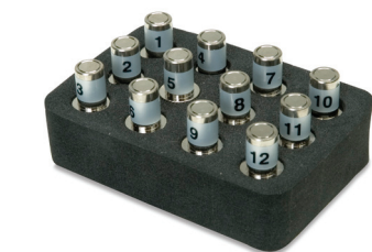
12 ID Only Coax Remotes