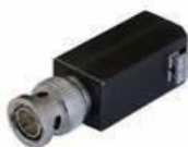
DS-1H18 Video Balun