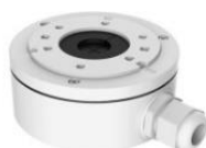
DS-1280ZJ-XS Junction Box