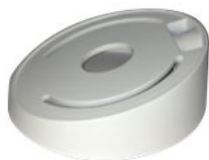
Inclined ceiling mount DS-1259ZJ