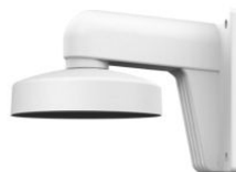
Wall mount DS-1272ZJ-110