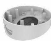
DS-1281ZJ-DM23 Inclined Ceiling Mount