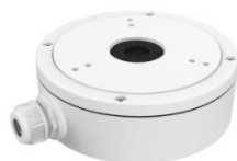
DS-1280ZJ-M Junction Box