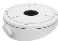
DS-1281ZJ-M Inclined Ceiling Mount