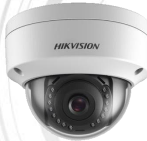
2.8 mm Fixed Lens