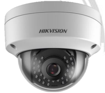
4 mm Fixed Lens