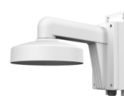
DS-1473ZJ-135B Wall Mount with Junction Box