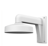
DS-1473ZJ-135 Wall Mount