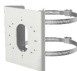
DS-1275ZJ-S-SUS Vertical Pole Mount