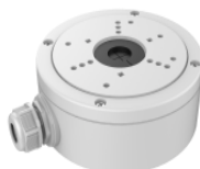
DS-1280ZJ-S Junction Box