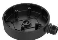
DS-1280ZJ-DM55(Black) Junction Box