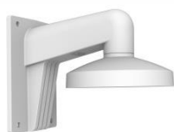
DS-1473ZJ-155 Wall Mount