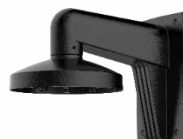
DS-1473ZJ-155(Black) Wall Mount