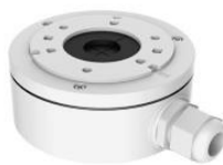
DS-1280ZJ-XS Junction Box