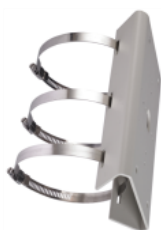
DS-1275ZI-SUS Vertical Pole Mount