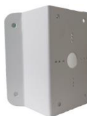
DS-1276ZI-SUS Corner Mount