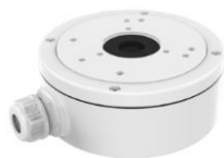
DS-1280ZJ-S Junction box