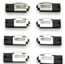
Fiber holder Holders