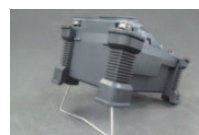
⑤ Angled Stand in Action