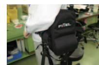
⑥ -2 Working Belt in Action