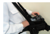
⑥ -1 Working Belt in Action