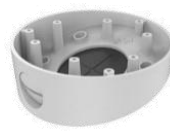
DS-1281ZJ-DM23 Inclined Ceiling Mount