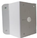
DS-1276ZJ-SUS Corner Mount